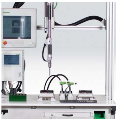
Close-up of Screwdriver on an intelligent Workstation