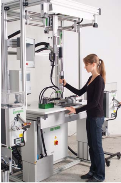
Complete Workstation with HMI, Feeder(s), Controller, Part Fixture

When assembling highly sensitive printed circuit boards for the HCU series on intelligent manual work stations the electronic components are protected by targeted electro-static discharge. The ESD-enabled DEPRAG solutions function continuously (for all components of the manual work stations) and this is recordable and verifiable for the end-user. The same care is taken in the realisation of technical cleanliness. Dirt particles can damage sensitive components. They can be created in the feeding of connection elements or by screw assembly itself. To minimise the danger of dirt particles in the production process the following can be utilised: feeding systems without vibration, positioning and assembly of connection parts with vacuum suction or particle killers. The requirements for technical cleanliness and ESD-capability should be continuously realised for all individual components of a system. It is therefore of a great advantage when all components are coordinated.