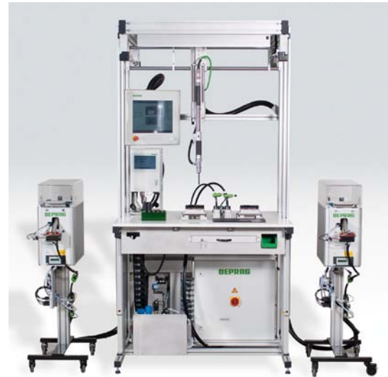
Complete Workstation with automatic Screwfeeding