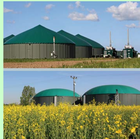
Application examples - biogas plants and CO-generation plants

Energy recovery using the DEPRAG turbine generator is appropriate for use in many application areas. When smelting metals, for example aluminum and copper, the melting tanks are cooled by compressed air. The compressed air flows through cooling channels and absorbs heat. Normally, it is then released into the atmosphere. With the new micro-expansion turbine and integrated generator this is changed into electricity and fed back into the power network. A sample calculation for compressed air illustrates this: with an inlet pressure of 20 bar (abs.), an outlet pressure of 5 bar (abs.) and an inlet temperature of 180°C with a corresponding mass flow, the GET turbine generator can recover the electric power of approx. 20 kW.