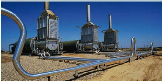
Application example: natural gas pipelines

The feed-in systems for 25-50 kW are specifically developed performance electronics for high-speed generators. Additional add-on functions and safety functions such as network monitoring and braking resistors can be taken into account, as well as specific measurement and cooling concepts.