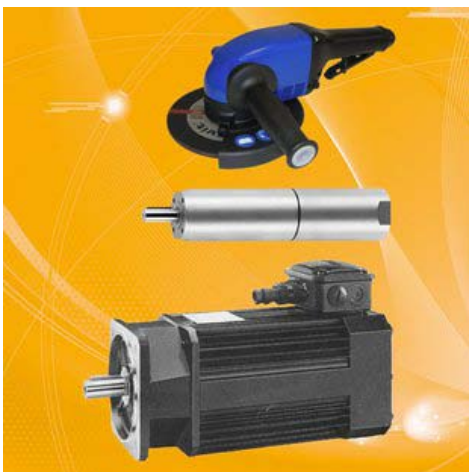
Motor - size comparison

Dagmar Dübbelde: At this point we should again highlight the turbine drive's low air consumption figures. On average it uses a third less compressed air than a vane motor. With a centrifugal governor to govern the speed of the turbine motor, air consumption can be reduced further by 50 percent. No other air motor works as efficiently! The turbines do not need oil, and there are no wear parts. And let us not forget the low noise level. This is another point in favor of using a turbine.