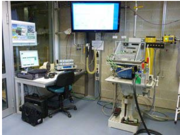
Test facilities Technical University Amberg-Weiden

Trixy Schmidt: If I am a plant engineer in search of the ideal motor for my application I basically have to decide whether the drive for my motor should be pneumatic or electric? DEPRAG boasts decades of experience in the production of air motors but in the screw fastening sector it also makes use of electric screwdrivers. What are the advantages of compressed air as an operating fluid?