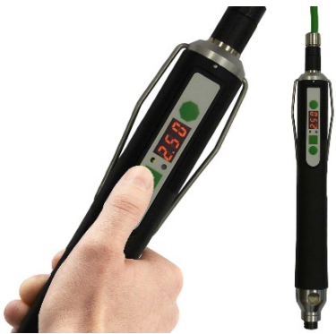
The MINIMAT™-ED for work spaces with varying tightening parameters

The MINIMAT-EC series for torques from 0.01 to 25 Nm also features a brushless electric drive and corresponding power-off controller. The processing parameters stored for the assembly task are edited, documented and evaluated using the screwdriver. Both screwdriver families in EC and EC-Servo design allow connection to a superior control system, e.g., for the recording and evaluation of statistical processing data.