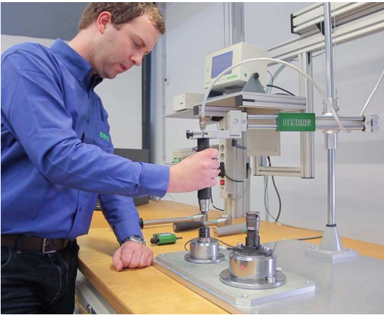
Screw joint analysis being performed by DEPRAG Application Engineers

component. We deliberately use excessive torque so that the screw or component breaks, thereby enabling us to establish the overload torque". This process is repeated, using original components, until a reliable result has been ascertained.