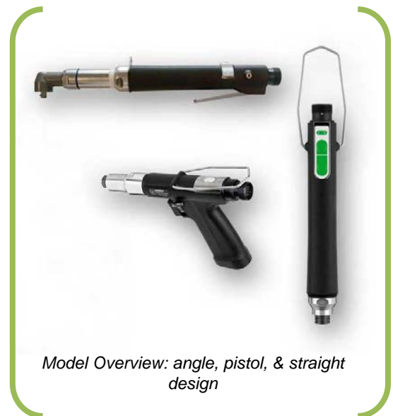
Model Overview: angle, pistol, & straight design

Impulse screwdrivers with shut-off mechanism are an impact wrench but with a hydraulic impulse striking mechanism. The impulse screwdriver features a high torque output, excellent torque repeatability and a low back-out torque. They are considerably quieter than a device with a mechanical striking mechanism. DEPRAG impulse screwdrivers are equipped with pistol or fist grip. The hammer is directly connected to the rotor in these gearless impulse screwdrivers. Energy is "collected" during each rotation which is transmitted as a powerful impulse to the screwdriving spindle via a moveable clutch-claw.