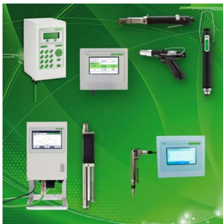
EC- and EC-Servo Screwdrivers with corresponding Controllers

One example of an intelligent component is the positioning control in combination with a part fixture and integrated sensors. The processing sequence is thereby predetermined, visually displayed and the correct working sequence can be controlled. Positioning control concepts from DEPRAG are based on diverse solutions, for example position control stands or portals in varying designs for all kinds of applications. Optimal processing reliability is guaranteed with the MINIMAT® EC screwdriver. The torque, angle, speed, waiting time and rotational direction can be freely programmed within the performance range of each spindle and thereby adapted to each individual screwdriving task. The integrated torque and angle measurement ensures precise control of screw tightening as well as documentation of important processing parameters. Together the position control stand and EC screwdriver are an effective method of coordinating processing. The screwdriver will only start if the selected sequence is adhered to.