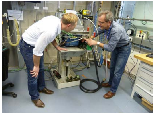
Test facilities Technical University Amberg-Weiden

The Amberg-Weiden University is one of the newer, but highly-distinguished universities in Bavaria. For the past 19 years with around 3200 students, the 82 professors have devoted themselves to teaching modern topics such as: "renewable energy", "energy efficiency," and "rational use of energy".