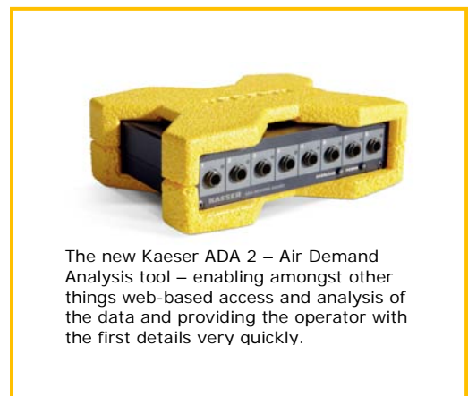
The new Kaeser ADA 2 – Air Demand Analysis tool – enabling amongst other things web-based access and analysis of the data and providing the operator with the first details very quickly.

Kaeser, is one of the leading manufacturers and suppliers of products and services on the subject of compressed air. The range of know-how includes compressed air, compressed air purification and air distribution. The focus is always on reliability, energy efficiency and cost. Kaeser offers a complete line of air system products including rotary screw compressors with the highly efficient Sigma Profile and the Sigma Control system, Mobilair portable compressors, Omega rotary lobe blowers, vacuum packages, refrigerated and desiccant dryers, filters, condensate management systems and a variety of related products, as well as services such as consulting, planning, analysis and contracting. Kaeser is represented with over 400 employees in more than 100 countries worldwide either by its own subsidiaries or through exclusive partners.