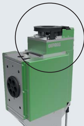
Screw-magazine for 31 screws

While one magazine is docked on the FFS-Unit and in operation to systematically feed up-to 31 fasteners, a second magazine is being filled in the Magazine-RXS by the screwfeeder. The screwfeeder, located outside of the robot work area, feeds screws to the magazine-RXS located inside the robot cell. If the mounted magazine is (partially) empty, the robot unloads it at the magazine-RXS and picks-up a full magazine to continue with the assembly. This solution assures the best possible cycle time while guaranteeing the topmost process reliability.