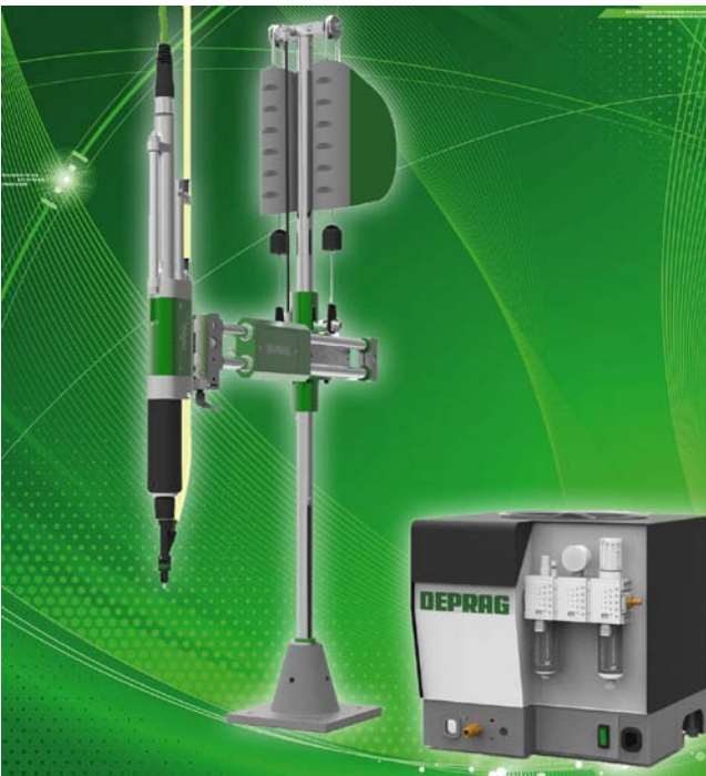
DEPRAG FEED MODULE – D F M