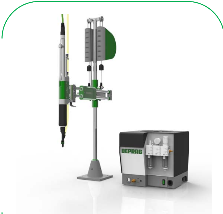
The DEPRAG Feed Module enables access to restricted or recessed screw locations

There is an increasing trend in the assembly industry: Fully automatic assembly is taking a backseat to intelligent manual work stations. Around 15 years ago companies were investing in automatic systems to increase processing reliability – the required zero error quota or permissible deviations in the lowest ppm (parts per minute) range were at this time not possible in manual assembly processes due to the unpredictable human factor involved. What came out of the economic crisis of 2008/2009 was that when orders rapidly decreased, fully automatic systems would not have a 100 percent and therefore, economic workload utilization. If the demand increases unexpectedly and exceeds the capacity by the possible 100 percent then again automatic production cannot adapt to the overcapacity. The company cannot react adequately to the recovered full order books.