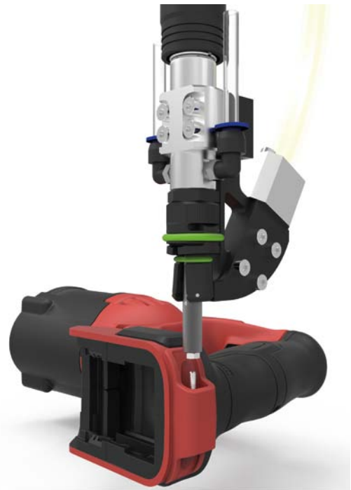
DEPRAG FEED MODULE Nut assembly with automated feeding

Even components which require a nut rather than a screw as the joining element can be fed and assembled reliably with the DEPRAG Feed Module. The Sales Manger added: “For DEPRAG this is a real first. For the first time we can offer manual nut feeding with the DFM”. An integrated stroke mechanism via cylinder controls the precise pressure on the joining element, the screw or nut. The feed stroke can be set according to the pressure required and thereby the same pressure is always applied to the components during assembly, it is not dependent from the physique and condition of the operator. The force for the stroke is precisely defined and automatically controlled by the Feed Module.