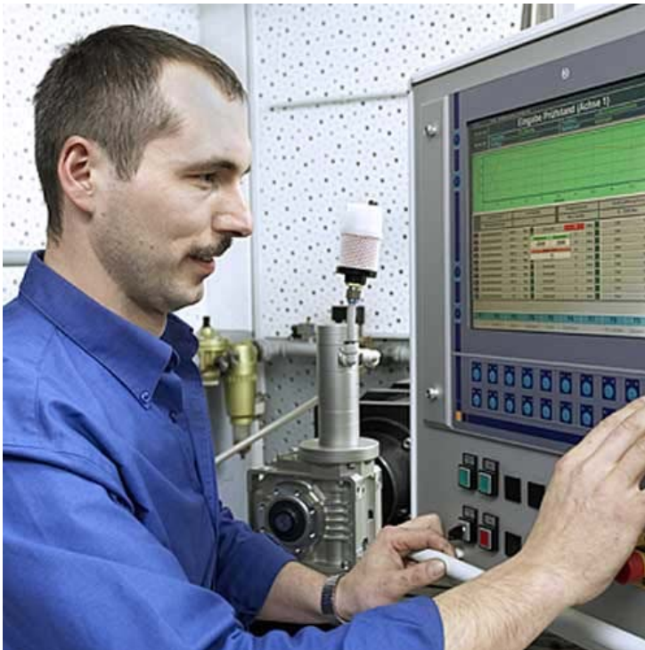
Test-Stand for Air Motors

The functional principle of an air vane motor is simple: An air vane motor consists of a rotor, which revolves around an eccentric cylinder. The vanes are pressed against the outside of the rotor wall by centrifugal force and build working chambers. The compressed air expands in these working chambers; pressure energy is converted into kinetic energy, and the rotor turns.