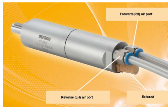
DEPRAG motor port description

Answer: "The air inlet connection which is named R (for right-hand rotation) should be connected to the main air supply. It is important that both the air connection for the left-hand rotation (named L) and the exhaust port remain open or are at maximum covered with a filter. This is the only way for the motor to start without problems and achieve its full power capability".