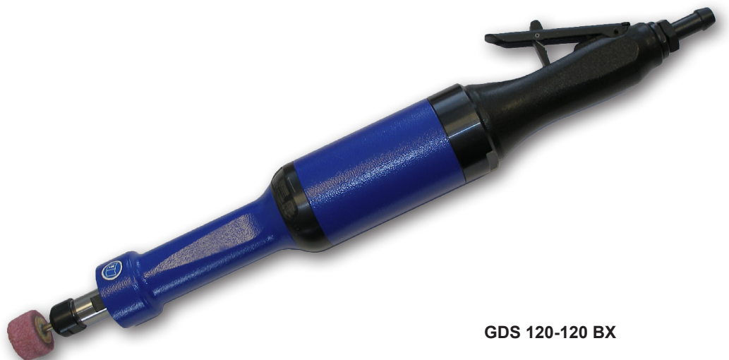
GDS 120-120 BX

We recommend the use of a maintenance unit with a minimum air-connection of 1/2-inch and a filter porosity of 20 µm (part number 6021281A).