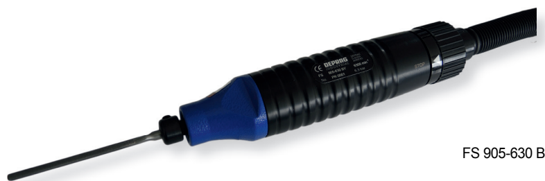
FS 905-630 BY