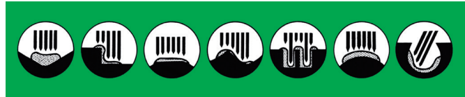
Fig. Adjust of Needles