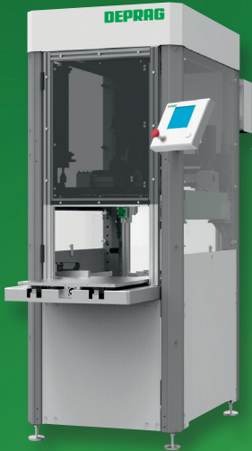
version sliding door