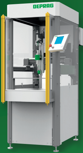
version light curtain