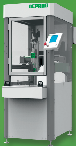
version rotary indexing table